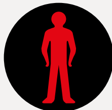
“DON'T WALK” (DON'T CROSS) SYMBOL