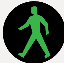
“WALK” (CROSS) SYMBOL