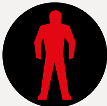
“DON'T WALK” (DON'T CROSS) SYMBOL