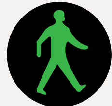
“WALK” (CROSS) SYMBOL